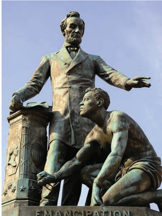
Figure 2. Thomas Ball, Emancipation Memorial , 1876; statue celebrating the emancipation of African Americans, Washington, D.C.