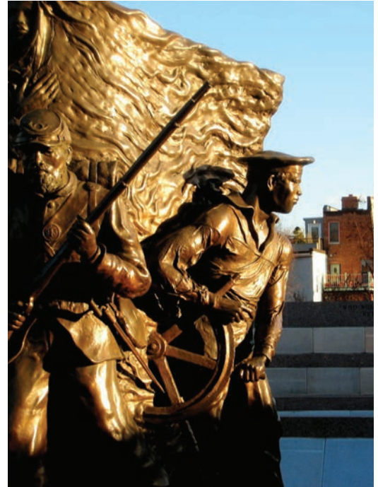
Figure 3. Ed Hamilton, African American Civil War Memorial (also known as the Spirit of Freedom ), 1998; statue honoring the service of African Americans during the Civil War, Washington, D.C.

This amendment and the other sources for this task (excerpts from the Confiscation Acts and the Emancipation Proclamation) can be used to establish the legal timeline of emancipation. In this way, they help students complete the first formative task, creating an annotated timeline that describes legal steps taken from 1861 to 1865 to end slavery.