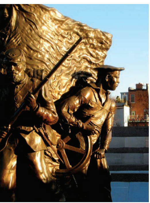
Figure 3. Ed Hamilton, African American Civil War Memorial (also known as the Spirit of Freedom), 1998; statue honoring the service of African Americans during the Civil War, Washington, D.C.

arguments through evidence-based claims.