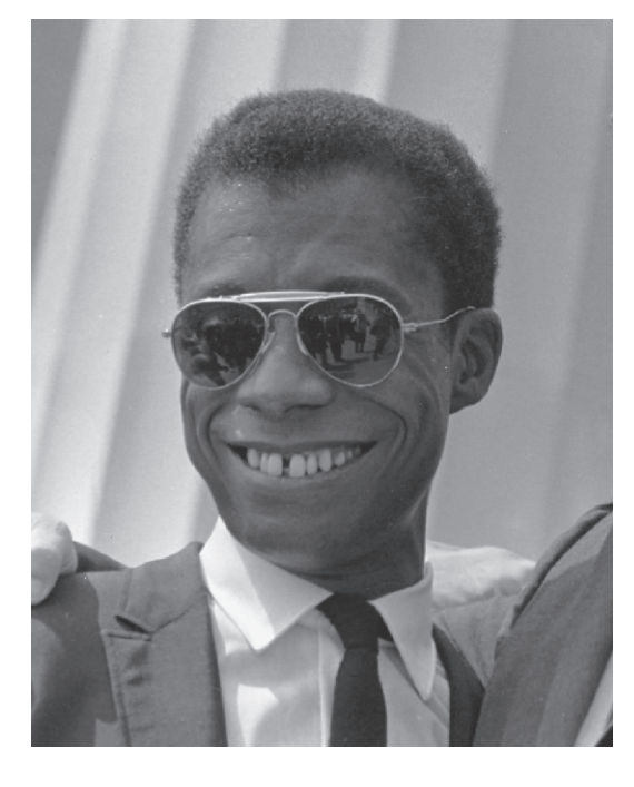
James Baldwin at the Civil Rights March on Washington.

tolerance.org/classroom-resources/lessons