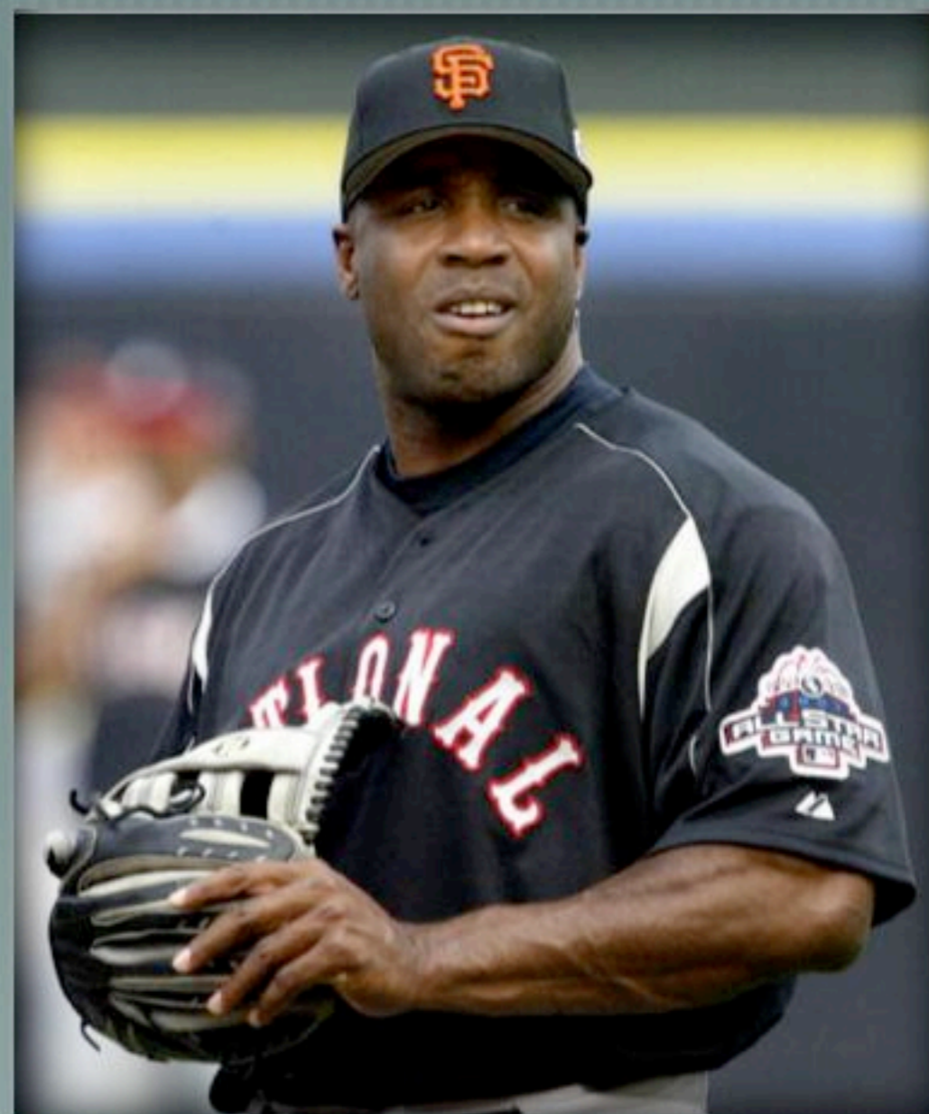
Barry Bonds Pro baseball player, 21st century