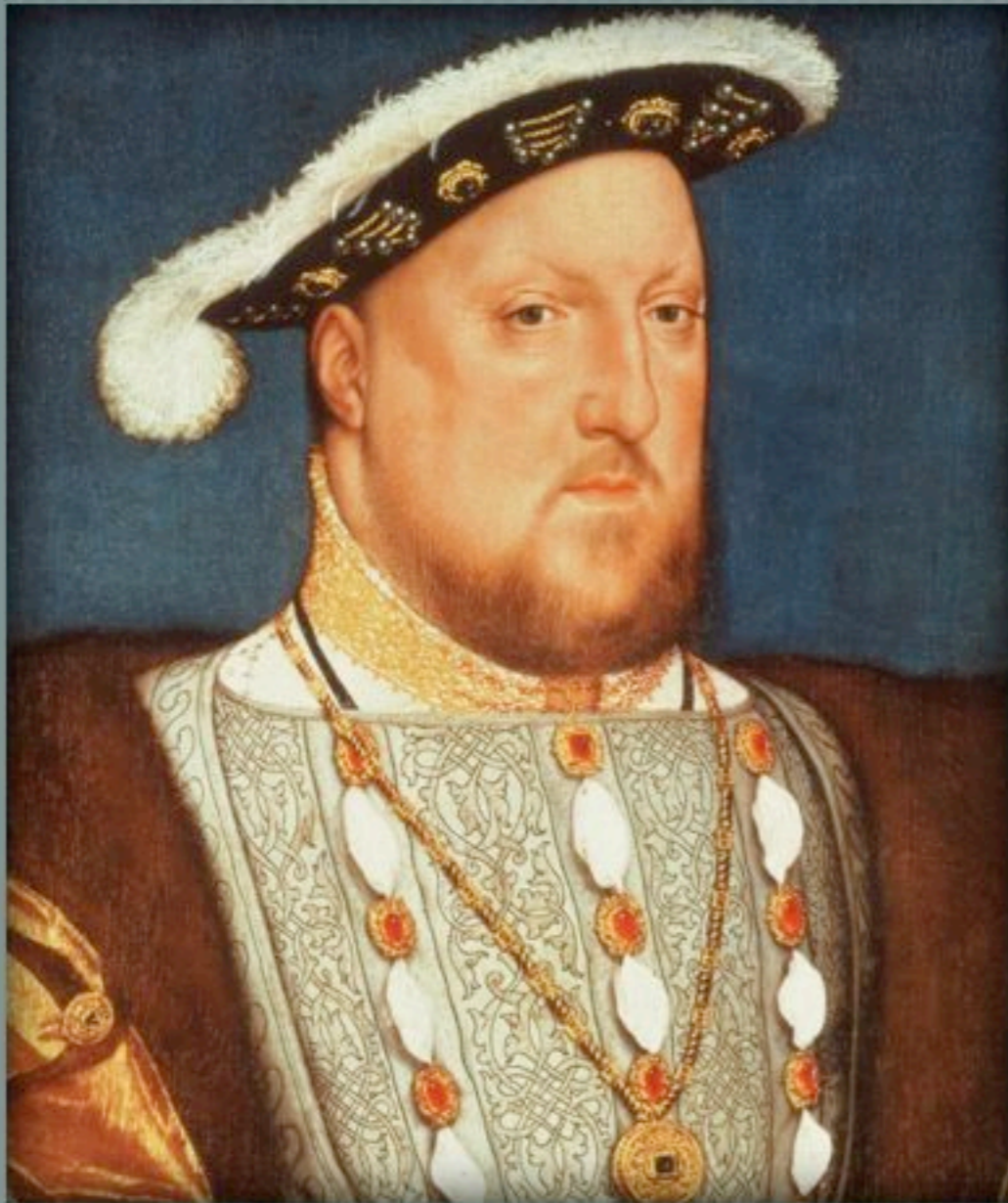
King Henry VIII 16th century