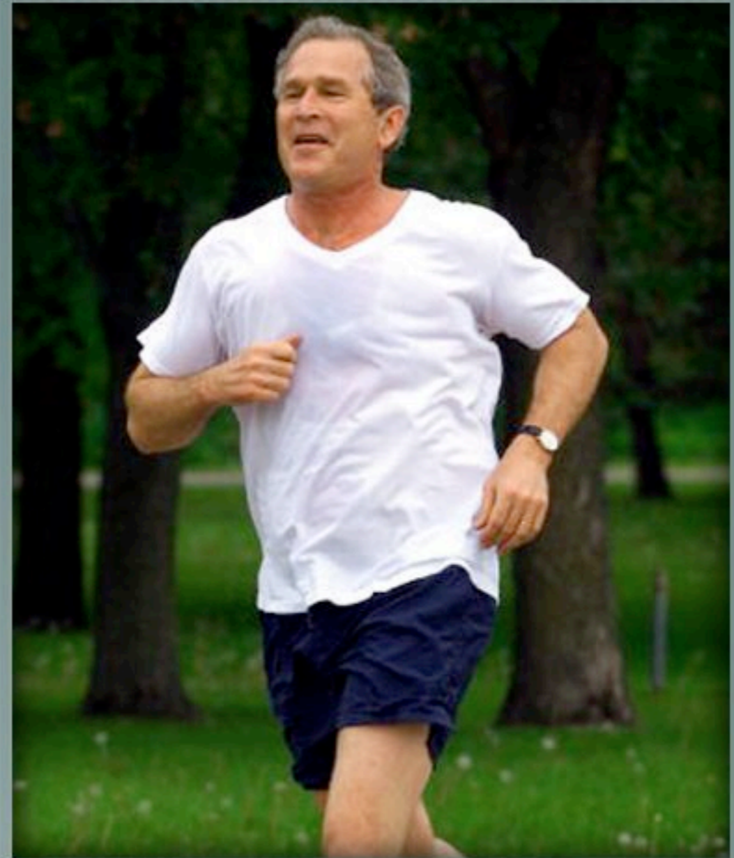
President Bush 21st century