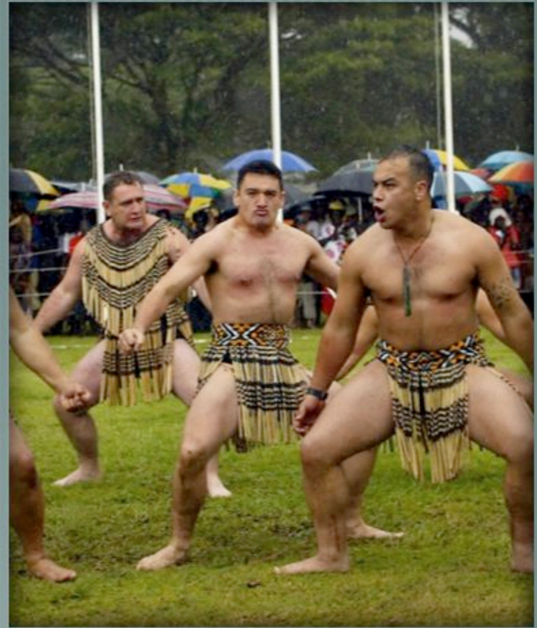
New Zealand dancers performing Maori haka