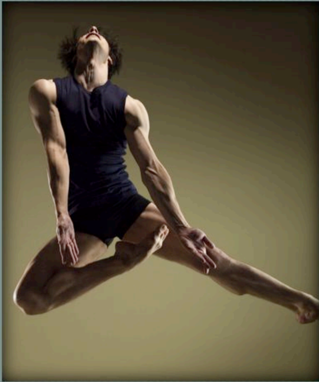
American dancer ballet