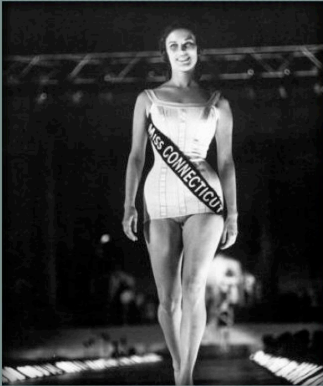
Miss America contestant 1950s