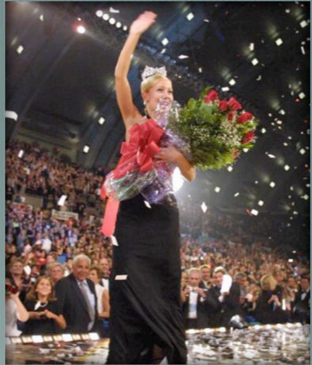
Miss America 2002