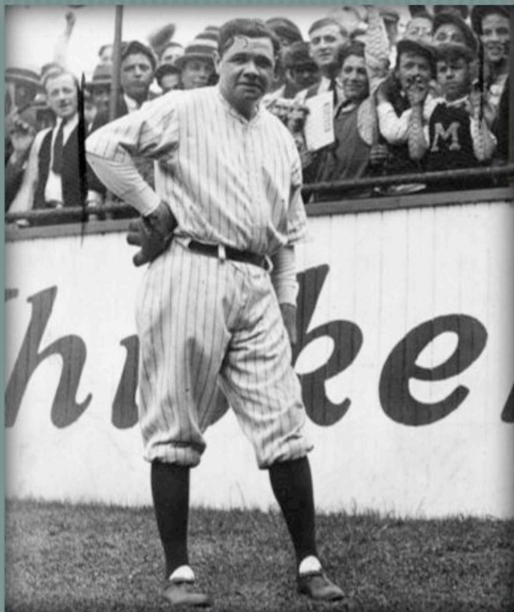
Babe Ruth Pro baseball player, early 20th century