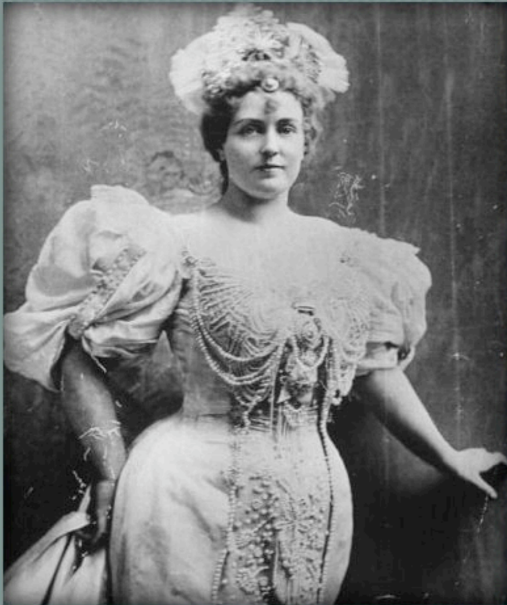
Lillian Russell Actress and Sex symbol, early 20th century