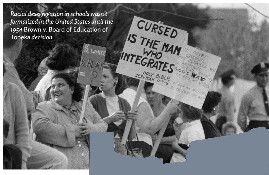
Racial desegregation in schools wasn't formalized in the United States until the 1954 Brown v. Board of Education of Topeka decision.

What’s one mechanism that has supported de facto segregation? Private schools. As black students began to enter white public schools across the South, a vast network of private schools appeared, seemingly overnight, to offer outlets for white families seeking to escape the results of school desegregation. This private school system created a new type of dual school system, with most black students attending public schools and most white students attending private schools. Schools were technically desegregated, but far from integrated—and far from equal.